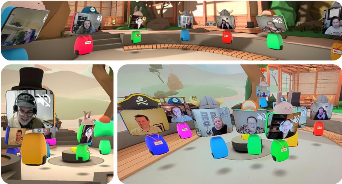
SURF members interacting through Mibo, a fun virtual platform, during the Virtual Leap Day Happy Hour (2/29/24).