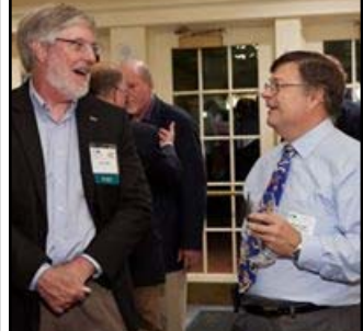
In 2017, SURF held meetings in Pasadena, CA (see photos to left and right) and Amherst, MA (see photo above)