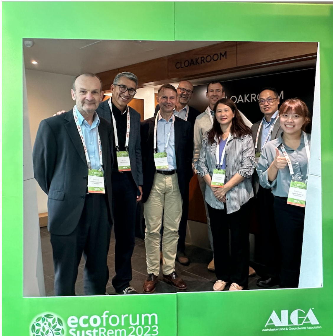
International Sustainable Remediation Alliance members at SustRem2023